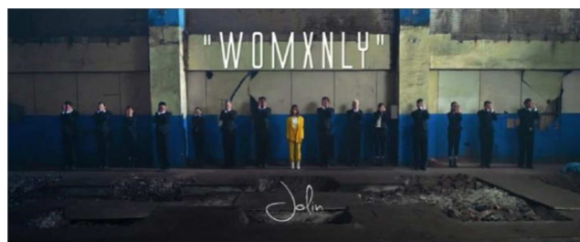
Figure 3. The title scene of the MV.

On CCTV’s programme--24 Hours on Dec. 5, 2019, a super public square dancing group of several--thousand persons drew people’s attention, most of whom were not the seniors but young people. They danced to the music, and moved their bodies at their pleasure without worrying their dance was at random. In fact, any person living in the world full of disciplines and pressures is eager for a carnival moment of the body or mind to some extent. That’s also why the MV is widely welcomed.